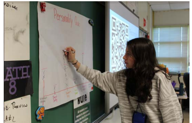
DELEGATE COMPLETING THE PERSONALITY QUIZ IN WORKSHOPS