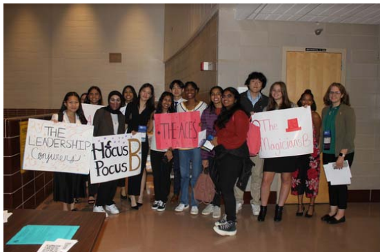
WORKSHOP PRESENTERS POSE FOR A PICTURE BEFORE DELEGATES ARRIVE