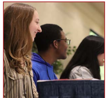
The MASC SLACers address the delegation.

This year, the MASC Convention combined elements from the traditional Convention with elements from one of MASC's former major conferences, the Legislative Session. This combination led to the adoption of a Civics Workshop covering information about bills, advocacy, and the student member of the state Board of Education (SMOB) position. The State Legislative Affairs Coordinators (SLACers) proposed stances on youth-related bills in the Maryland General Assembly. Students were also given information about the role and selection process for the SMOB position. This allowed them to prepare for listening to speeches and participating in a Q&A session with the candidates.