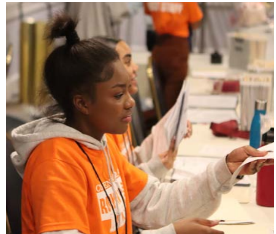
Members of the host staff check-in delegates and advisors.

During the December Executive Board meeting, Northwood High School and the Calvert Association of Student Councils (CASC) made successful bids to host the conference. Northwood High School, a part of the Montgomery County Regional SGA (MCR), hosted the main portion of the conference, recreational activities, decorations, and some set-up. CASC organized and ran the Advisor Hospitality area which included refreshments for advisors and provided themed baskets for an advisor drawing.